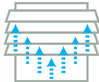
Fresh air enters through the vent to enter the building below.